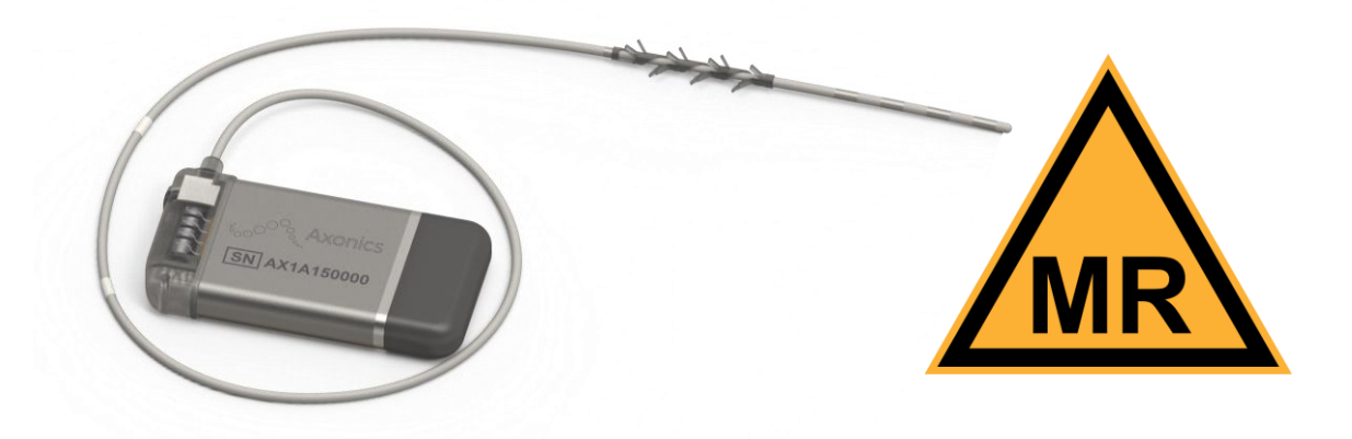
Figure 1: MR CONDITIONAL Axonics Devices

Non-clinical testing has demonstrated that the Axonics SNM System implant, i.e. the Neurostimulator (Model 1101) and Tined Lead (Model 1201/2201), is MR Conditional . A patient with this device can be safely scanned in an MR system meeting the following conditions: