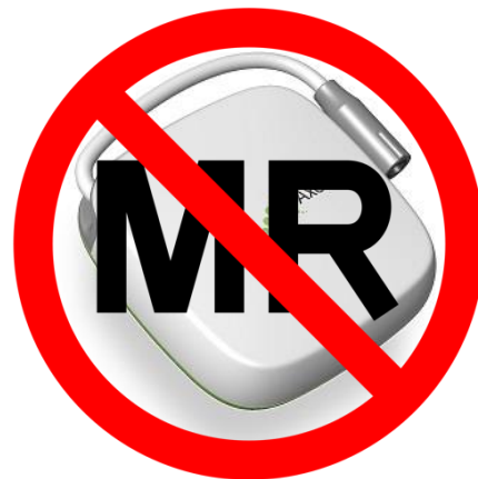
External Trial Stimulator, percutaneous leads and cables