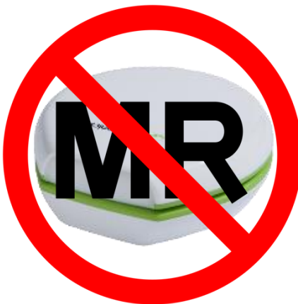
Charger and Dock