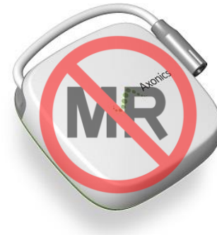
External Pulse Generator (Model 1601), percutaneous leads and cable (Model 1901, 9009, 9014)