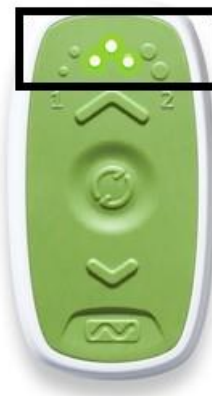
a. device is ready for MRI