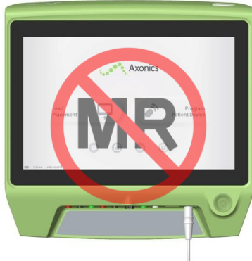
Clinician Programmer (Model 1501/2501)