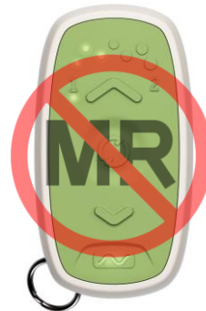
Remote Control (Model 1301/2301)