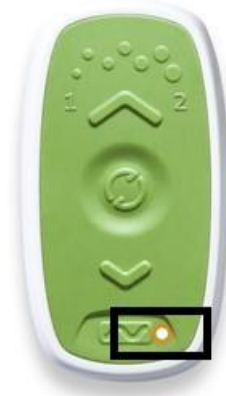
b. device is not ready for whole-body MRI